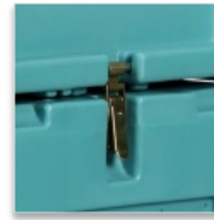
One mbedded fastener - can be lead-sealed