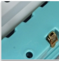
Contact point for opening sensor