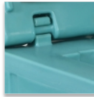
Box/lid articulation moulded, opening 115°