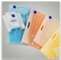
TOP 25 eutectic plate