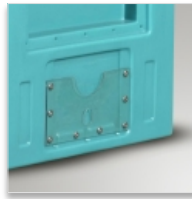
Embedded label holder