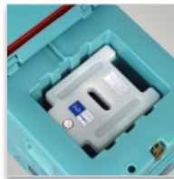
Moulded eutectic plate holder