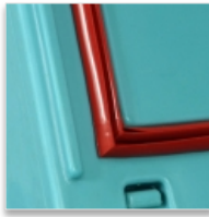
One-piece silicone frame seal