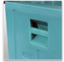
2 moulded handles