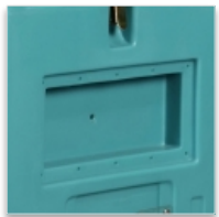
Space for electronic equipment